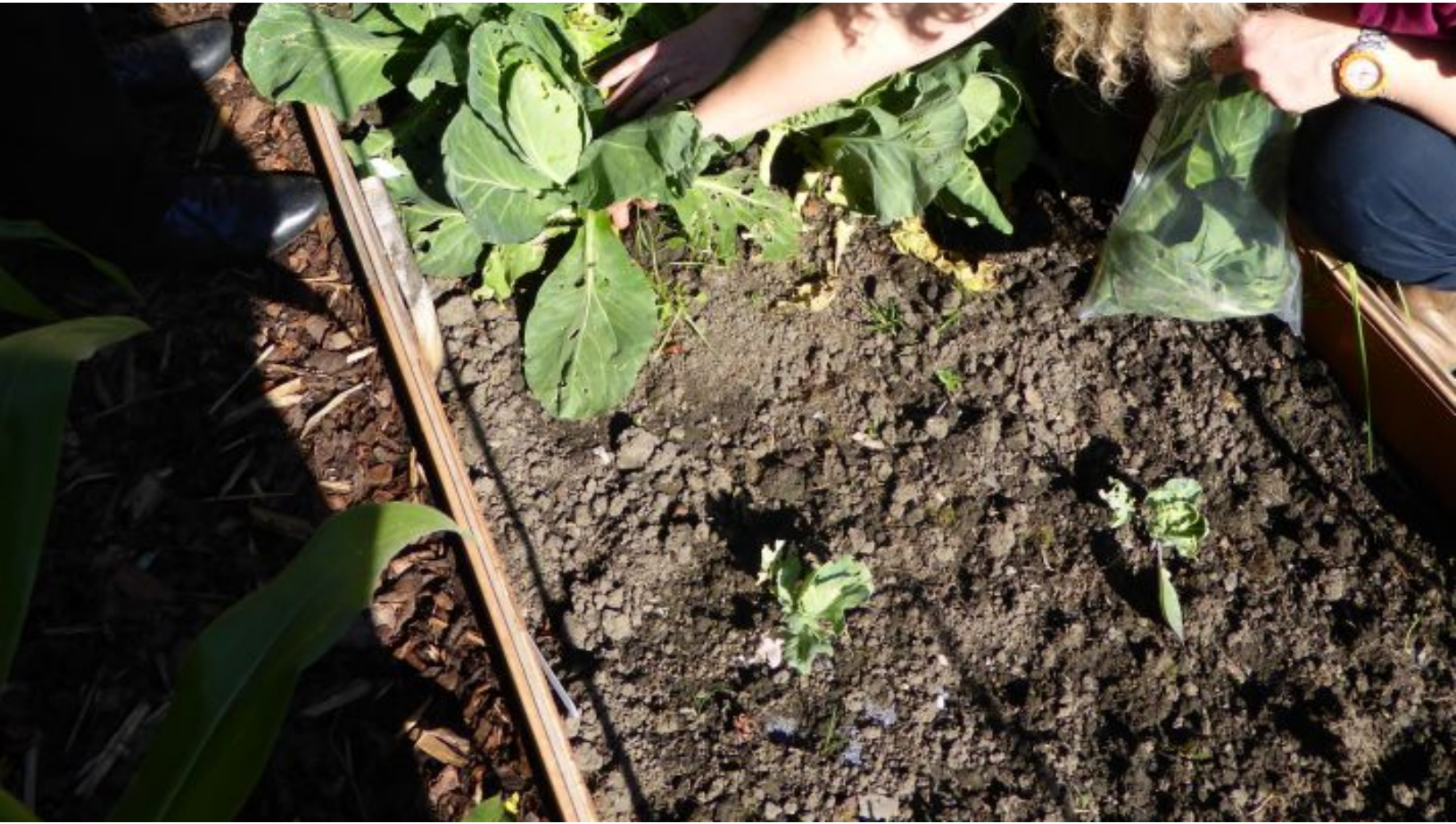
The researchers taking samples from a Newcastle allotment