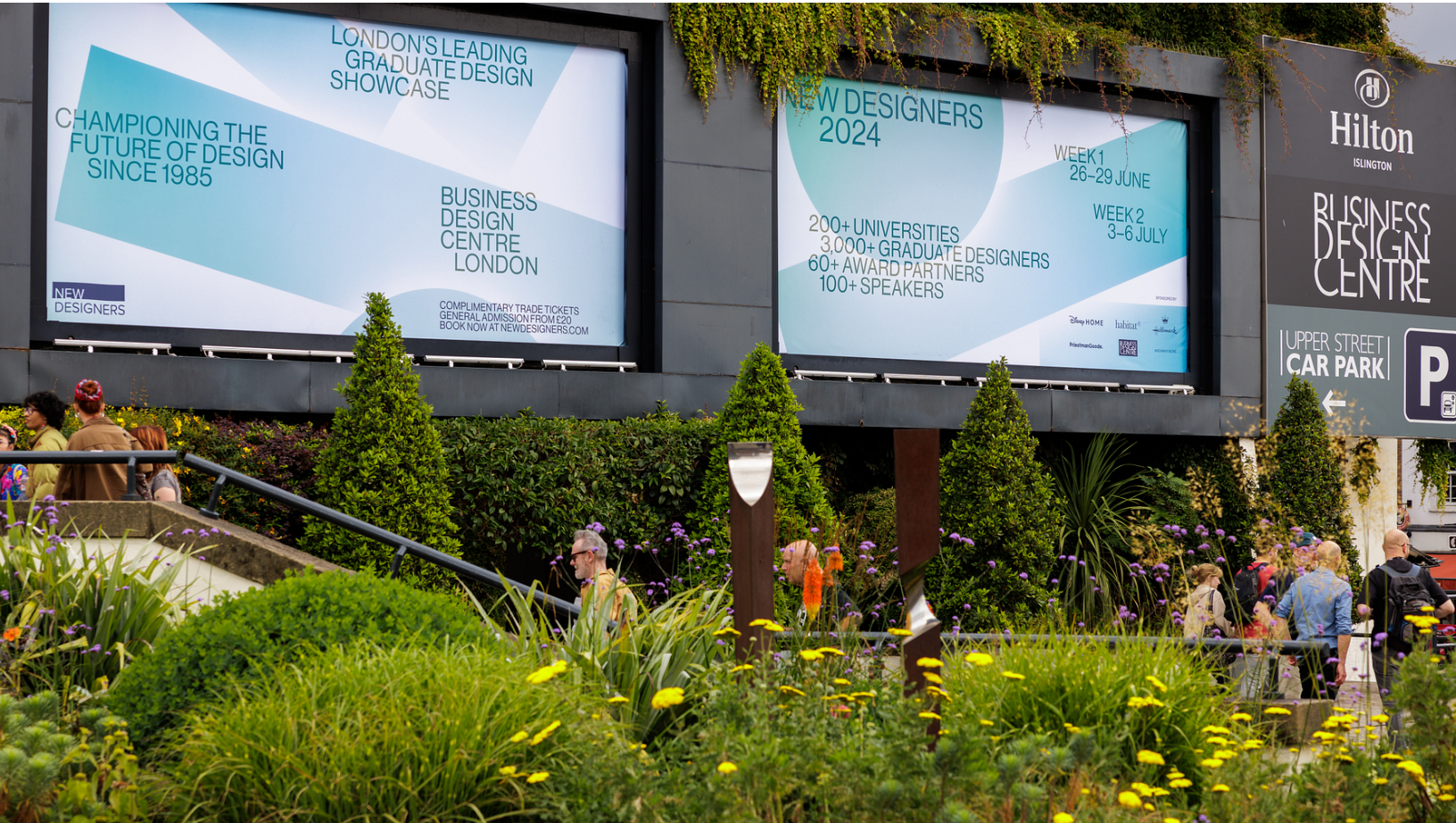
New Designers 2024 took place at London's Business Design Centre.