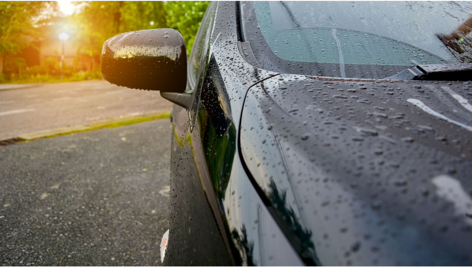
Water droplets evaporating on the surface of a car