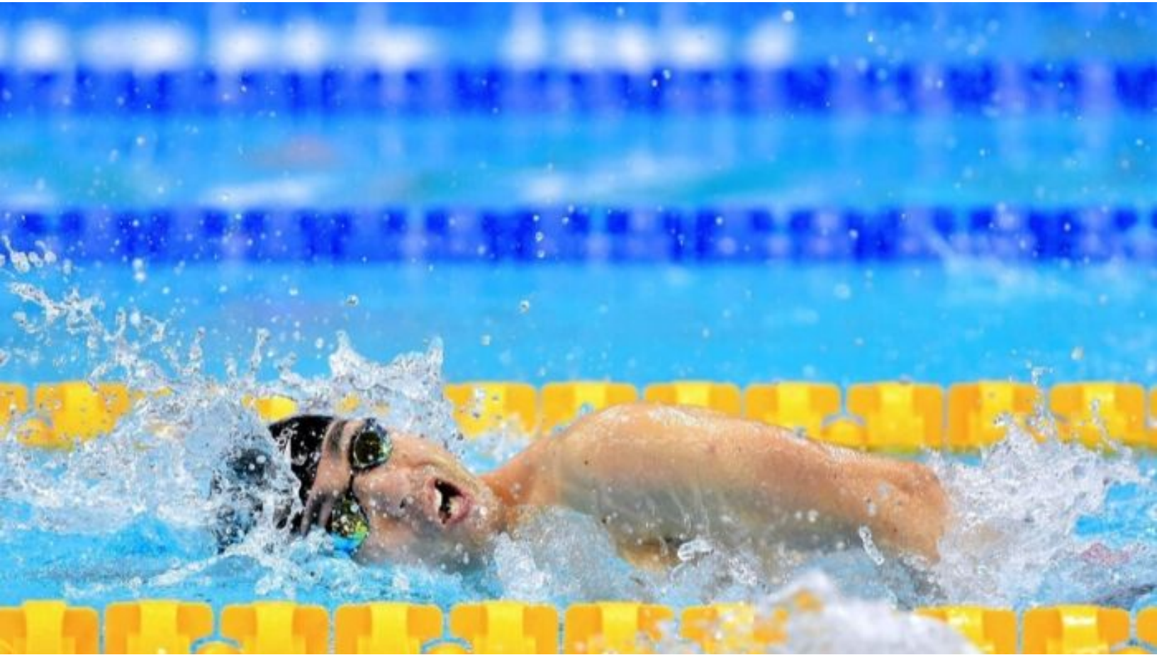
Taka Suzuki in action at the 2019 World Championships in London.