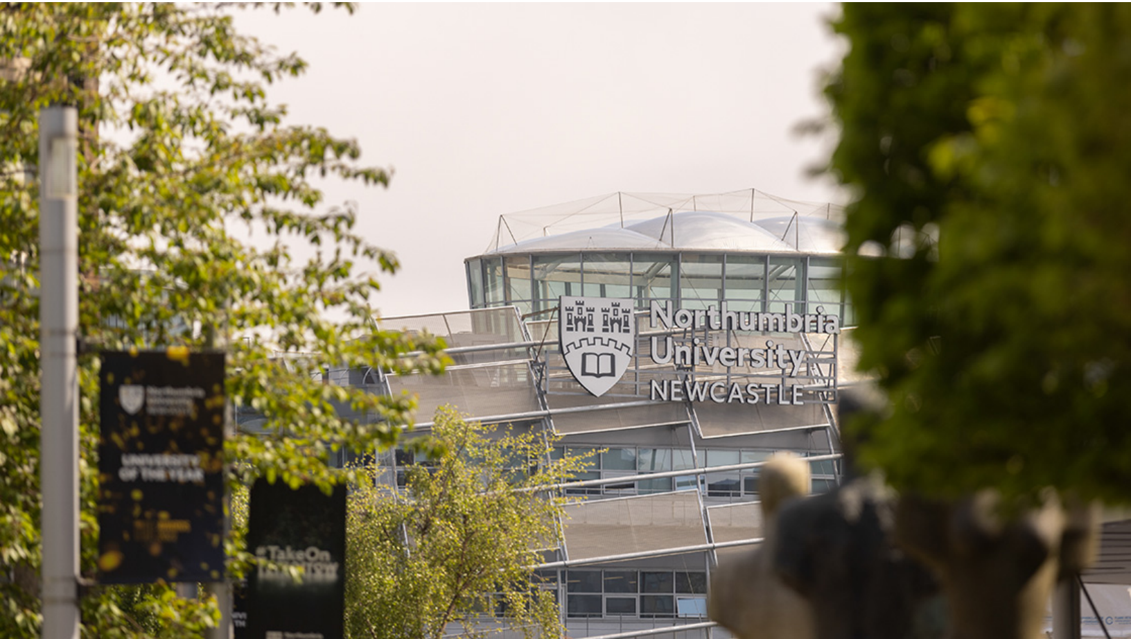
City Campus East at Northumbria University