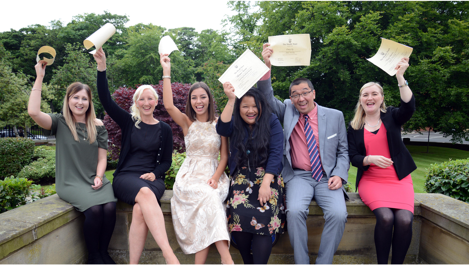
Nursing and Midwifery students with their awards