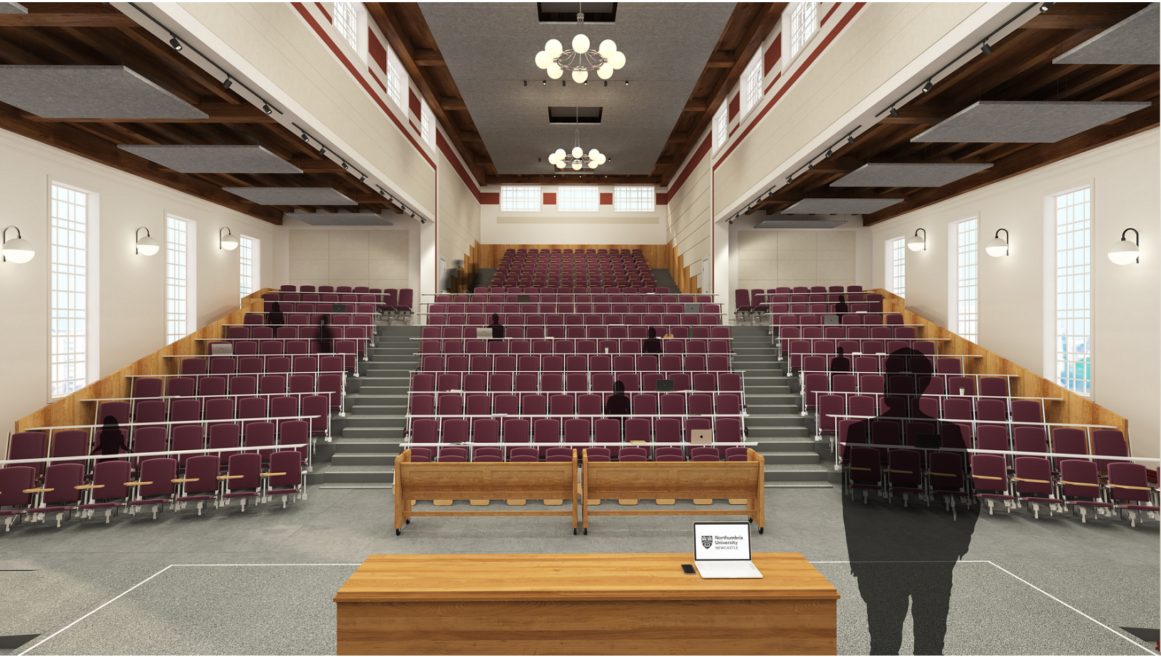
Durant Hall CGI (c) Aptus Construction